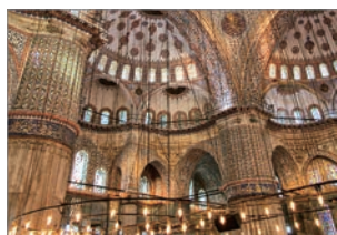
Mosque with reverb effect