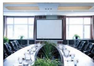
Conference & Lecture rooms