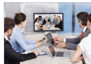
Video conference rooms