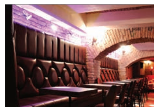
PA for restaurants